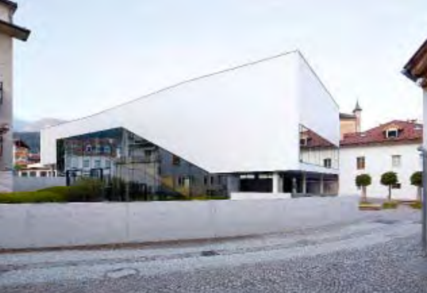
A new square was created in front of one of the entrances. Its shady garden and benches make it ideal for whiling away the day.